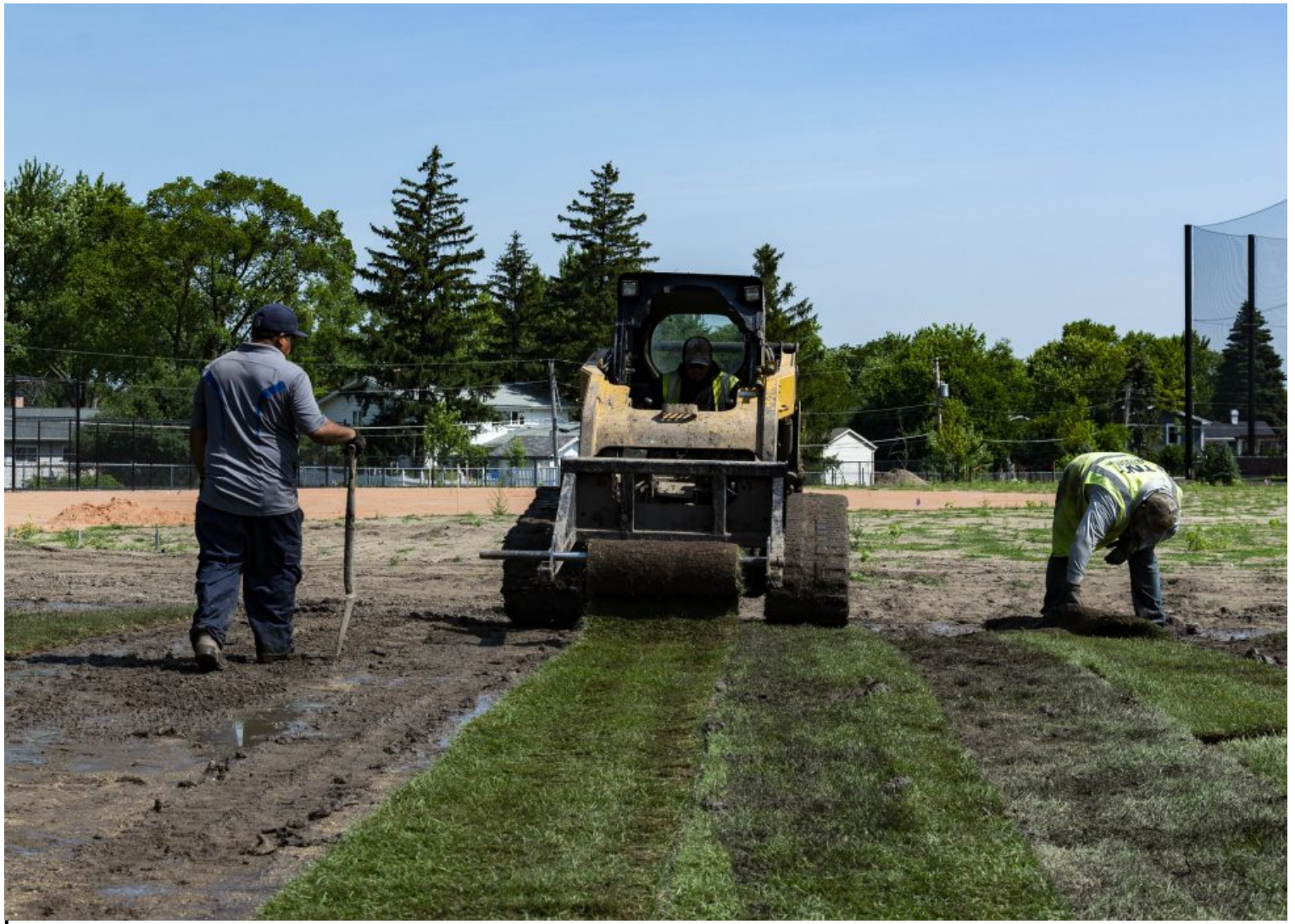
Crews lay sod in the outfield of James B. Conant High School's baseball outfield.