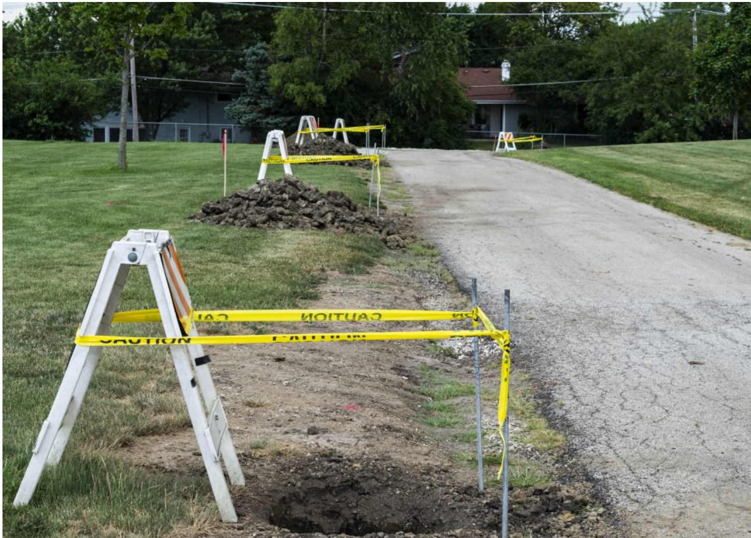
Crews dug out post holes for the installation of new safety lights between the fields at Hoffman Estates High School.

After being originally installed during the summer of 2009, the artificial turf at Hoffman Estates and Palatine High Schools had reached the end of its useful life. Both schools received new artificial turf in the stadium, as well as new surfacing on the running tracks. This completed phase two of a scheduled three-phase field improvement plan. In the final phase next year, Conant High School's stadium will be the final field to receive new artificial turf and track resurfacing. Work on Conant High School's baseball and softball fields, which began in 2018, is nearing completion as sod has recently been laid on these fields with the seed to be planted in the remaining areas soon.