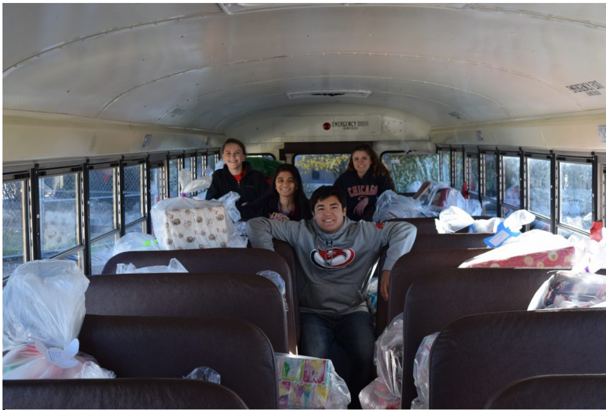
Students pose with a school bus full of presents donated to Palatine Township's Angel Tree program

"It's always a joy to see the bus pull up," Lindberg said. "We love when they drop off the gifts."