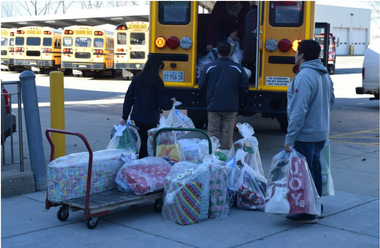
Students and staff from Palatine High School load presents into a school bus to be donated to the Palatine Township Angel Tree program.