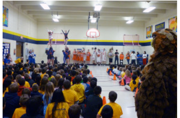
Students at Winston Churchill Elementary School showed excitement for reading while cheerleaders performed stunts.