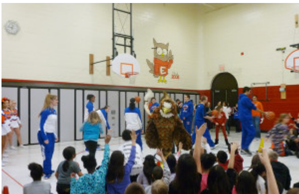
Students at Albert Einstein Elementary shoot hoops with the girls' and boys' varsity basketball teams.

Students who participate in the program are required to read a certain set of books which is determined by their teacher. If they reach that goal by the second week of January, they are given a voucher to attend a Hoffman Estates High School varsity boys' basketball game on Jan. 18. There, students will be recognized for their reading efforts at halftime, and will be eligible to participate in games and receive prizes.