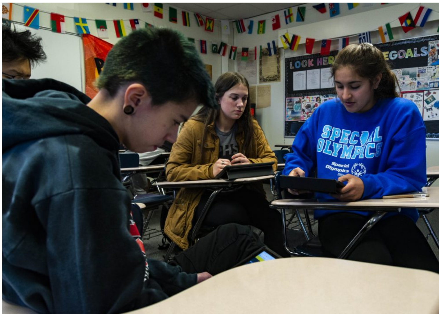
Teams of students in an AP Psychology class compete against each other during an in-class vocabulary competition.