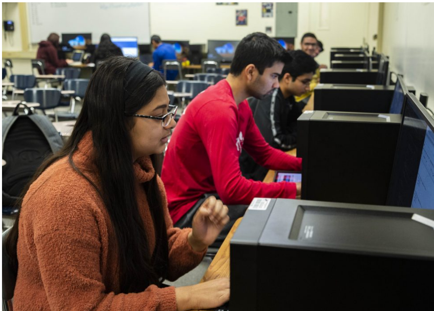
Students in Palatine High School’s AP Computer Science class write code to create a functional video game.