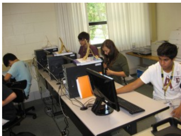
Students work in a summer Consumer Education course at Fremd.

When school is out for summer, there are many students who are focused on continuing their education, or brushing up on academic or athletic skills they might not have time for during the regular academic year.