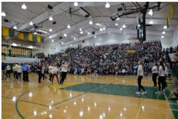
Students and staff participated in basketball games for prizes.