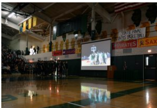
Highlights from the season were