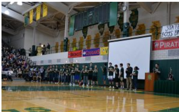
FHS celebrated the team's 4th place finish in the state tournament during a rally earlier this week.