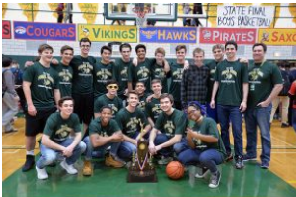
The team poses with the state

Fremd High School hosted a rally earlier this week to celebrate the Varsity Boys Basketball Team placing 4th in the IHSA State Tournament. During the rally, seniors on the team competed against staff members in a short basketball game. View photos of the rally below.