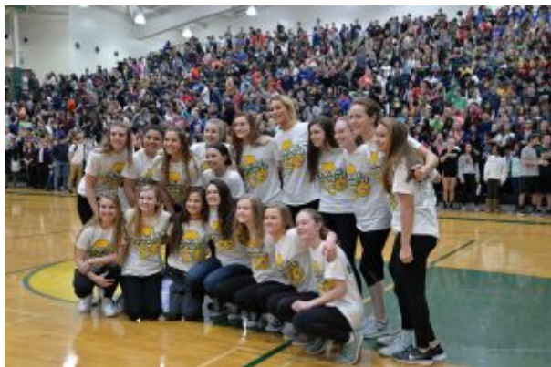
The Varsity Girls' Basketball team poses at a rally to celebrate their success at state.