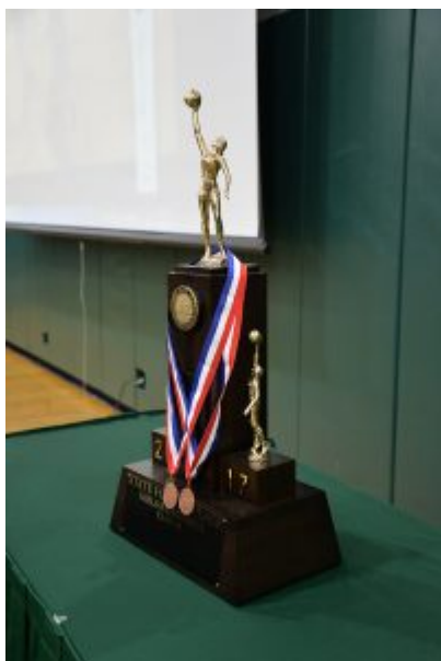
The FHS varsity girls' basketball team placed 4th in the IHSA State Tournament.