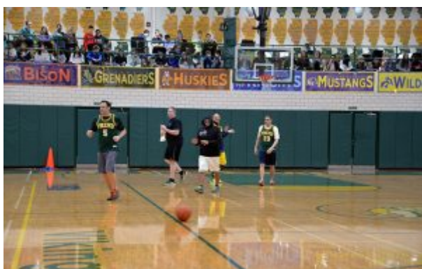
Seniors on the team take on staff members during a friendly basketball game during the rally.