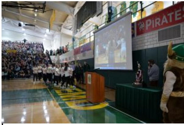
A highlight reel was played during the rally.