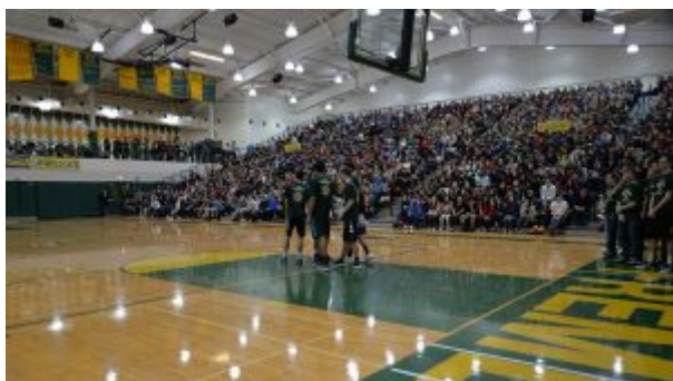
Seniors played a quick basketball game against staff members during the rally.