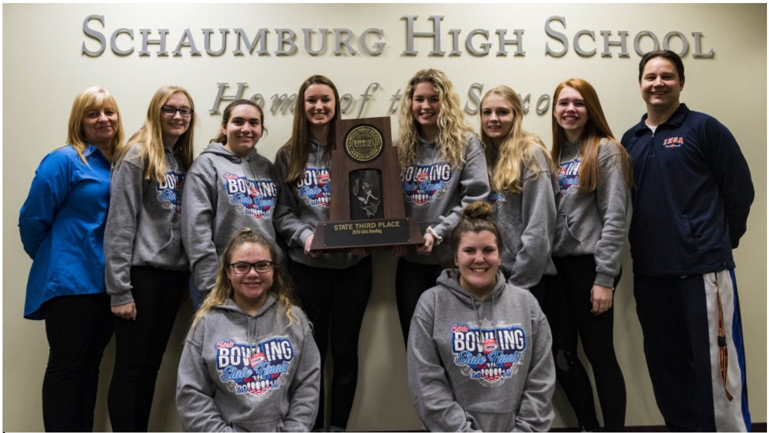
Members of the Schaumburg High School Girls Bowling team pose with the IHSA third place trophy.