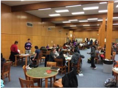
Students utilize extended hours to study at Fremd High School.

PHS: Students at Palatine High School will be able to study in the library during normal hours from 3:30 p.m. to 6 p.m. Students can then study in the library and café until 9 p.m. on Tuesday, Dec. 20. Staff will be available to direct students to the study areas.