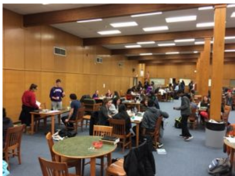
Students utilize extended hours to study at Fremd High School.

PHS: Students at Palatine High School will be able to study in the library during normal hours from 3:30 p.m. to 6 p.m. Students can then study in the library and café until 9 p.m. on Tuesday, Dec. 20. Staff will be available to direct students to the study areas.