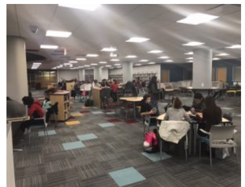
Students utilize extended media center hours for a Study Jam Session at Schaumburg High School.

Many District 211 students took advantage of last night’s extended media center hours to study for finals. As a reminder, all District 211 schools will have extended media center hours to provide students with a quiet space to study for finals. Read below to find out what each school is doing for its extended hours this week.