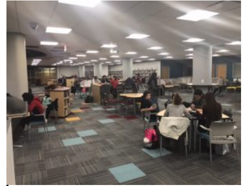
Students utilize extended media center hours for a Study Jam Session at Schaumburg High School.

Many District 211 students took advantage of last night's extended media center hours to study for finals. As a reminder, all District 211 schools will have extended media center hours to provide students with a quiet space to study for finals. Read below to find out what each school is doing for its extended hours this week.