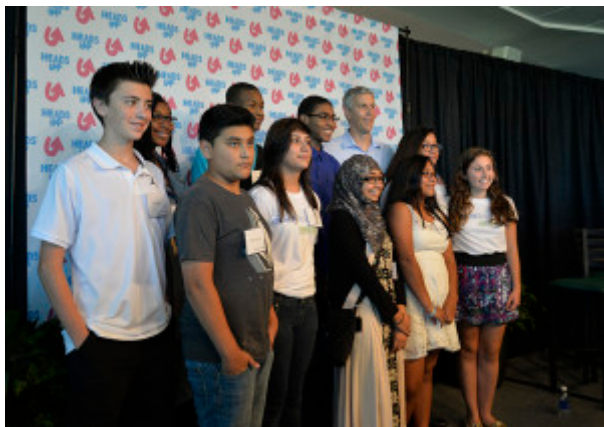
Palatine High School students attended the Harper College event and posed with U.S. Secretary of Education Arne Duncan (top right).

Under Harper College's Promise Scholarship Program, every student in the district can earn up to two years of tuition if they're willing to do the things in high school that will make them successful in college and in the workplace – maintain solid grades, have good attendance, do not repeat classes, and provide service to their community. The program aims to promote life skills and habits that will help students succeed in college and their careers.