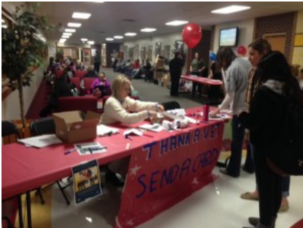
Students at Schaumburg High School could write letters to veterans.