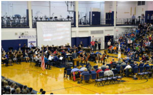
Conant High School's Veterans Day assembly.