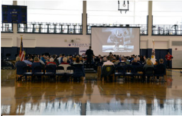
During the Veterans Day assembly at Conant High School, the school reflected on their own who have served in the military.