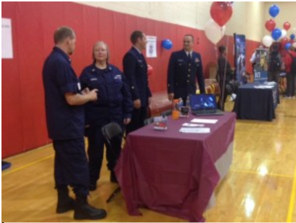
Students could interact with individuals from different branches of the military at Schaumburg High School.