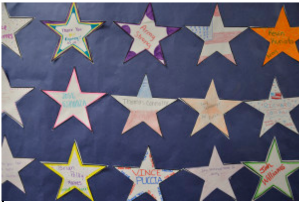
Stars honoring veterans at Palatine High School.