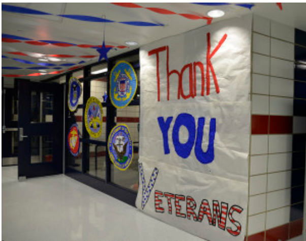
Decorations at Conant High School.