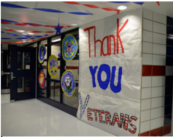
Decorations at Conant High School.