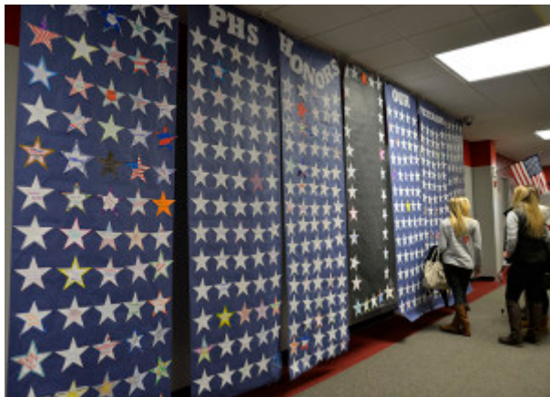
A display at Palatine High School honored veterans.