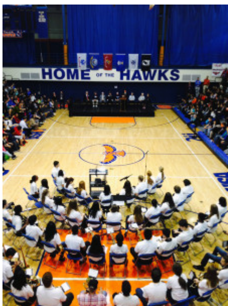
Hoffman Estates High School Veterans Day Assembly.