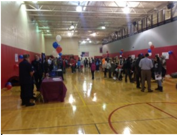
During Veterans Day at Schaumburg High School, students learned about different branches of the military.