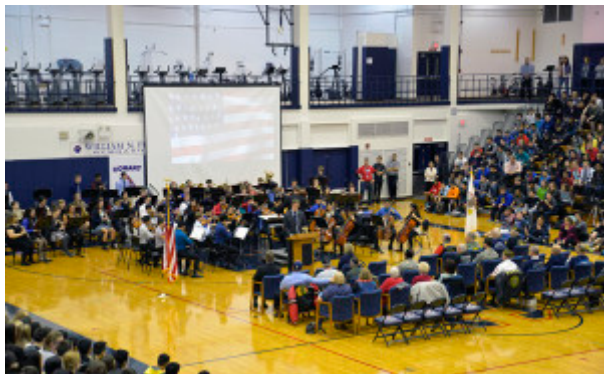
Conant High School's Veterans Day assembly.