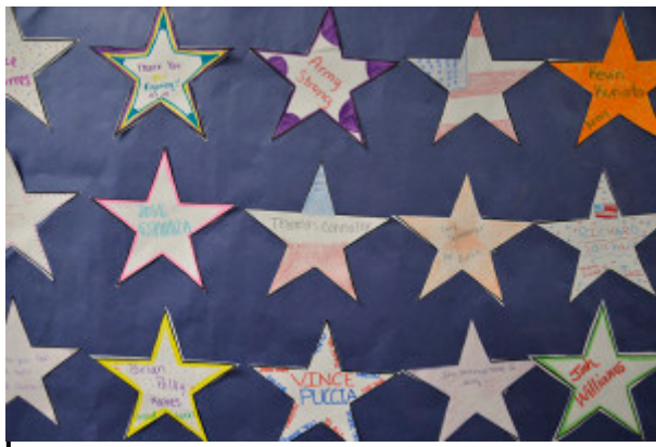
Stars honoring veterans at Palatine High School.