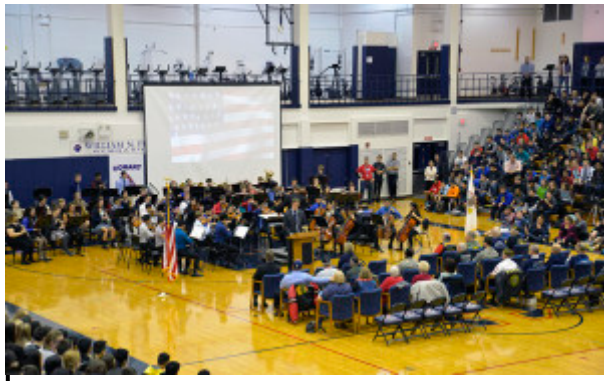
Conant High School's Veterans Day assembly.