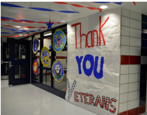
Decorations at Conant High School.