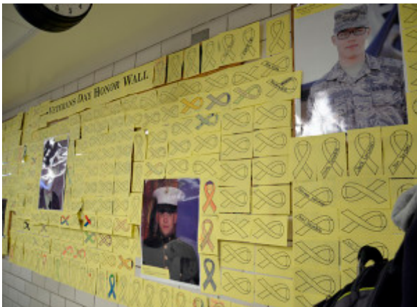
Fremd High School's hallway display to honor veterans greeted veterans when they walked into the building.