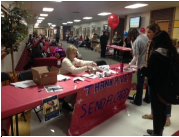
Students at Schaumburg High School could write letters to veterans.