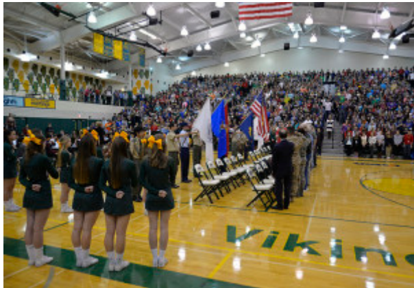
Local veterans were honored at Fremd High School during an assembly.