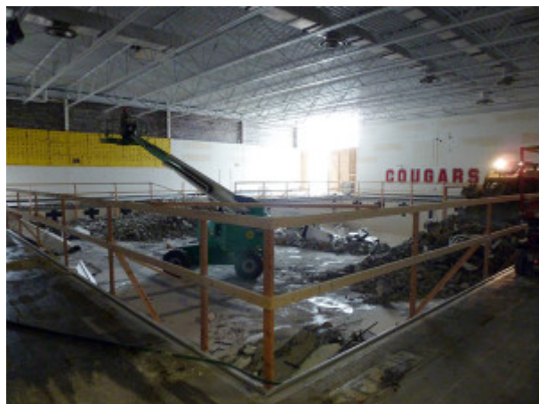
CHS' pool renovation

Renovations have started at Conant High School this summer on the building's main office and pool. The pool renovations will enhance student opportunities in physical education, athletics, and community programs, as well as update aging equipment that can continue on a regular maintenance schedule for many years to come.