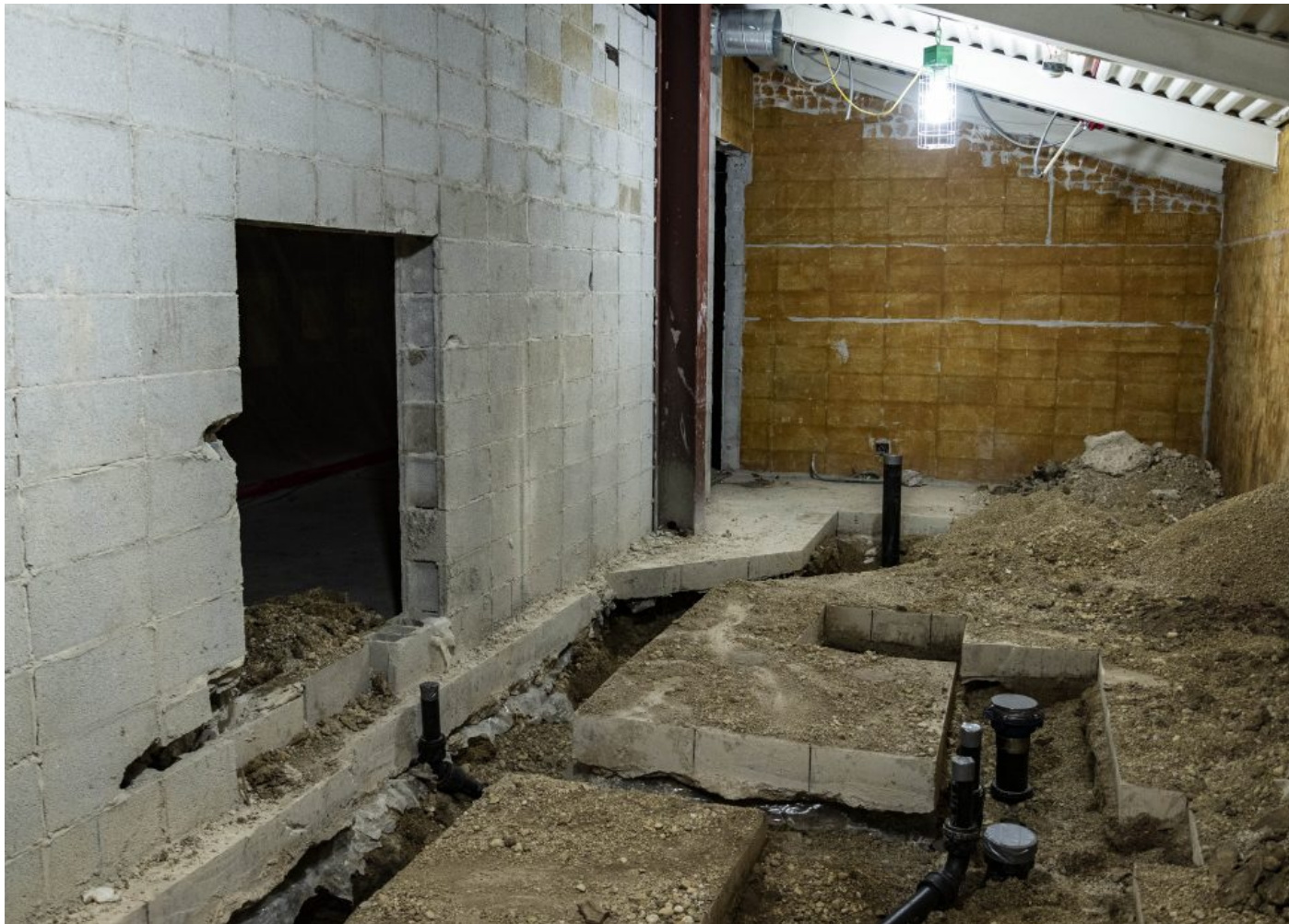
A bathroom at James B. Conant High School which has been torn down in preparation for a complete overhaul.