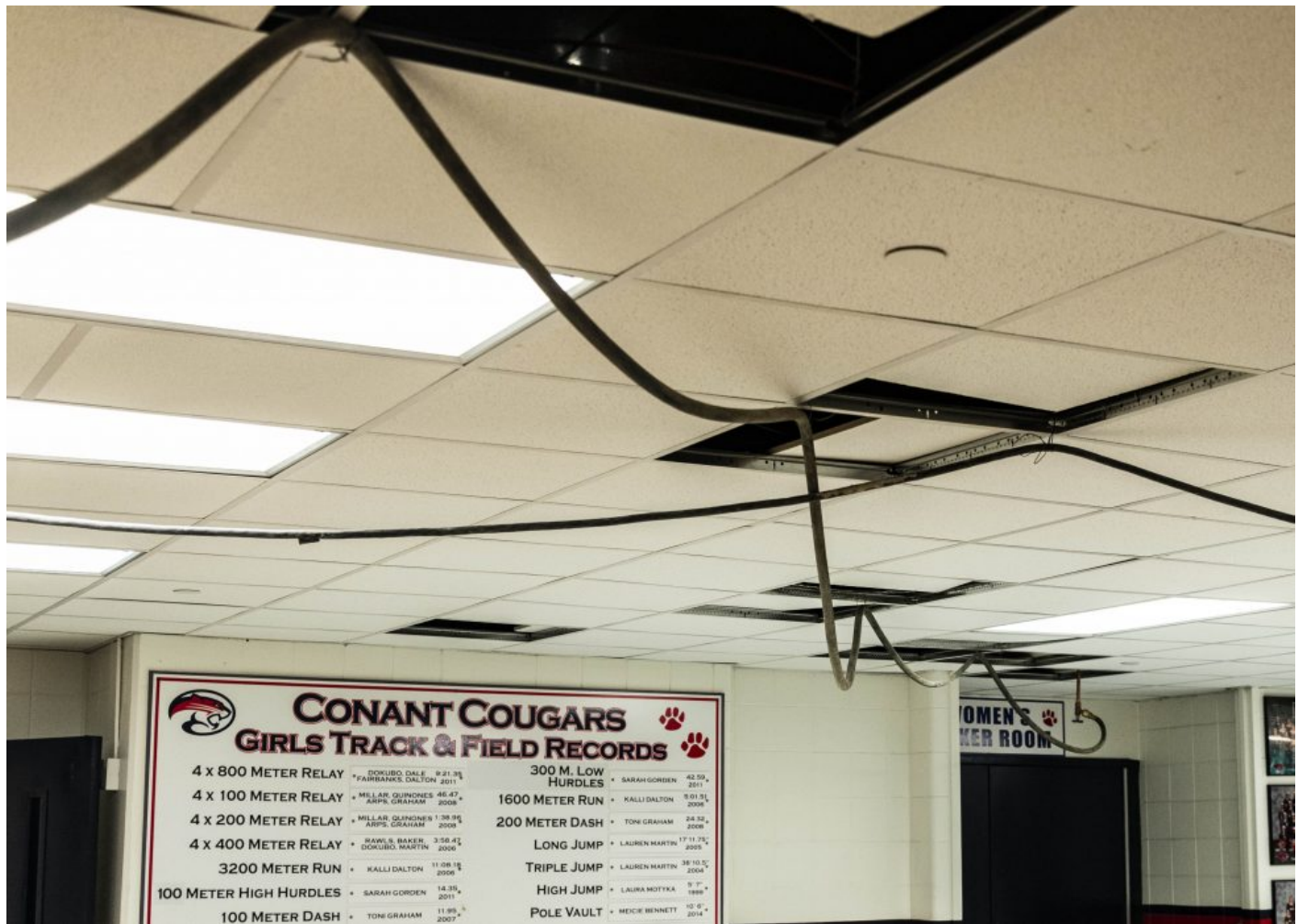
Temporary water lines span the ceilings of James B. Conant High School during construction on the school's bathrooms.