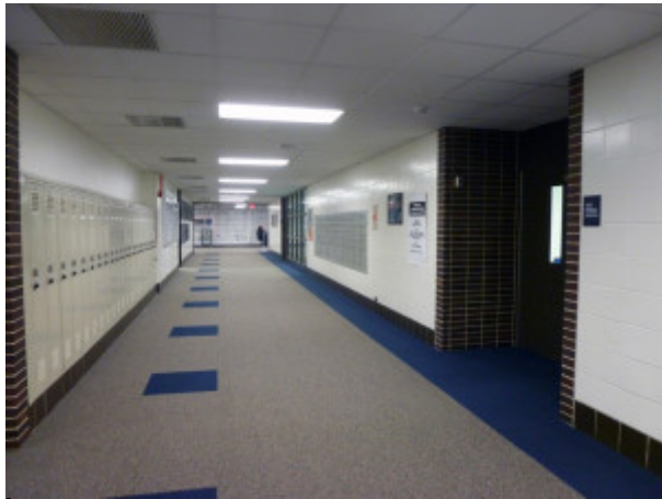
Lockers will be removed from where the main offices are located to increase student safety and update original building construction from 1962.

Another high priority renovation is Conant High School’s main office and guidance area renovation, which will replace original building construction from 1962. To increase student safety, any lockers in that hallway will be removed and the main offices will serve as checkpoints for school visitors without mixing in with students. This renovation will keep Conant’s offices up to date with the other schools in the District and increase safety standards.