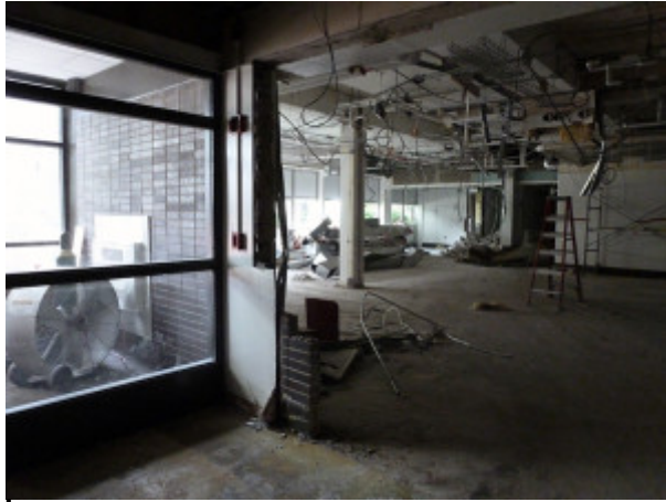
CHS' front entrance and main office are under construction

Another renovation is Conant High School's main office and guidance area renovation, which will replace original building construction from 1962. To increase student safety, any lockers in that hallway will be removed and the main offices will serve as checkpoints for school visitors without mixing in with students. This renovation will keep Conant's offices up to date with the other schools in the District and increase safety standards.