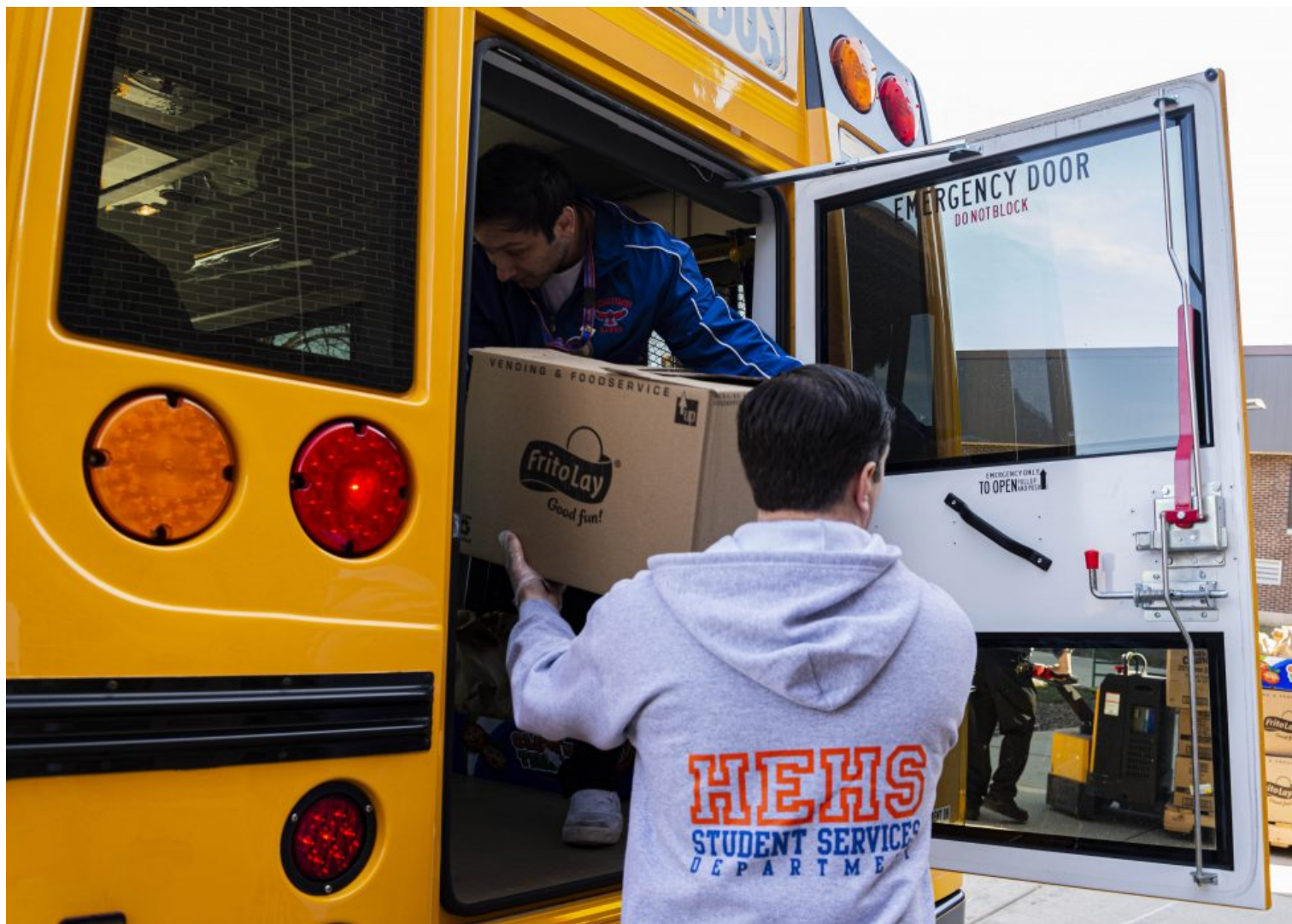
Staff members load meal bags into the back of a District 211 school bus March 13, 2020.

Following the decision by Township High School District 211 to begin the school year with remote learning, the food service and transportation departments have announced a plan for student meal deliveries.