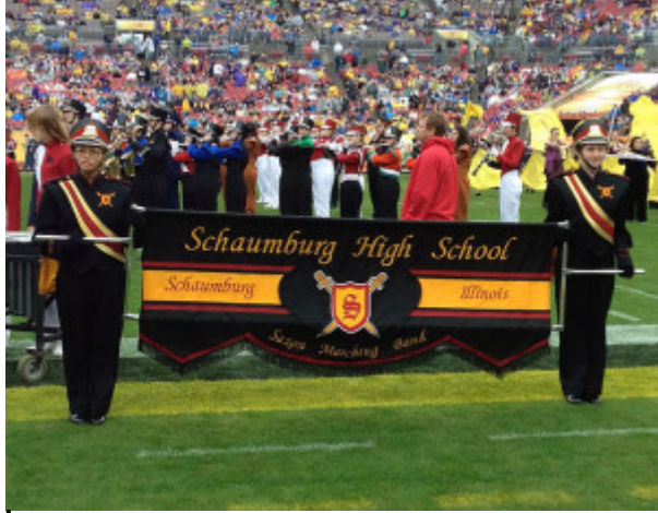
The SHS marching band performs during halftime at the Outback Bowl in Florida.